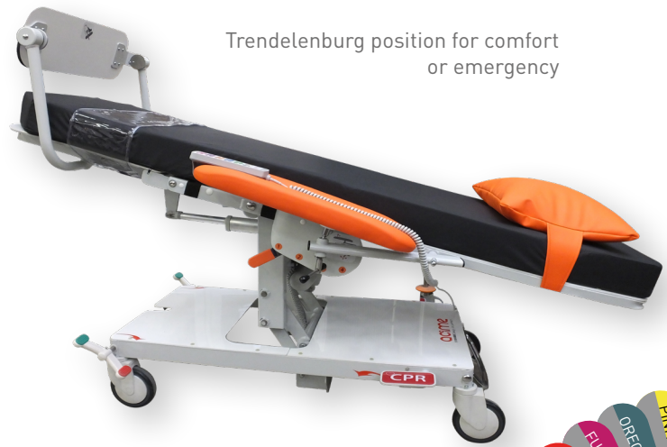
Trendelenburg position for comfort or emergency

Armrests' movements coordinated with the backrest