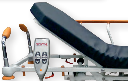
Patient's lockable remote control